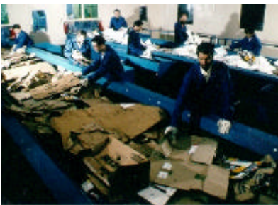
the picking conveyor

Grundon also have MRF's in Beenham, near Reading, Ewelme, near Oxford and a new MRF at Leatherhead, Surrey.