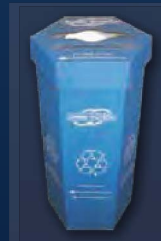
60 Litre Cardboard Bag Holder