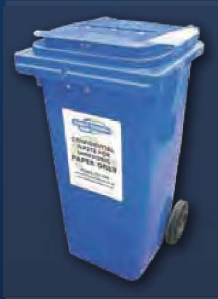
120 Litre Bin

A search outside 14 major banks found information on more than 5,000 customers.