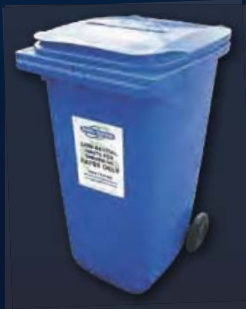
240 Litre Bin