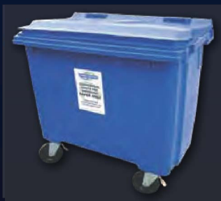
660 Litre Bin