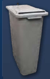
75 Litre Desk Side Bin