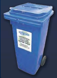
140 Litre Bin